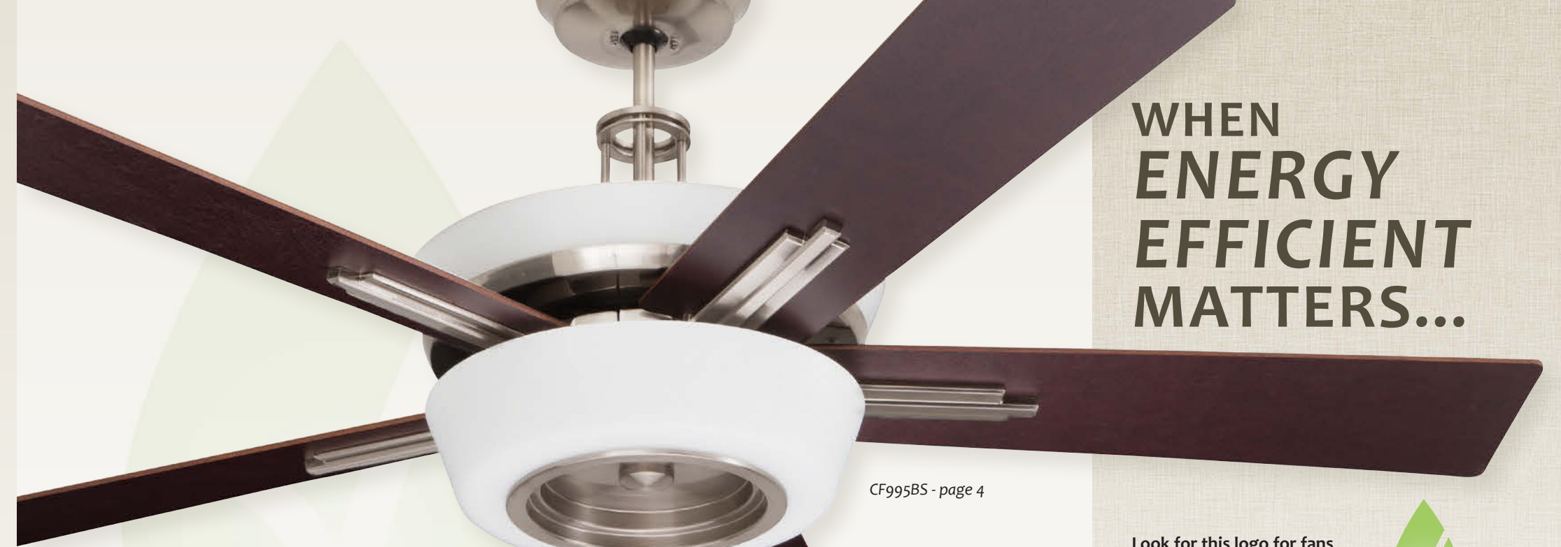
CF995BS - page 4