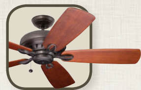
Penbrooke Select CF5100 - pg. 2

Emerson's Blade Select Series is a family of six different fan housings which can adapt to over 50 blade options in spans ranging from 42" to 72", from all-weather blades to veneer blades, to decorative solid wood blades. With various styles, performance features and the ability to customize the exact look, the Blade Select Series is sure to appease the design conscientious consumer. It's as easy as 1, 2, 3. Just look for the Blade Select Series logo for applicable models. See pages 32-33 of this brochure, our full line catalog or emersonfans.com to view all blade choices within the series.