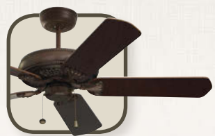
Crown Select CF4501 - pg. 22