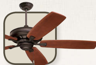
Carrera Grande Eco CF788 - pg. 6