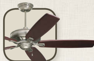
Carrera Grande CF787 - pg. 6