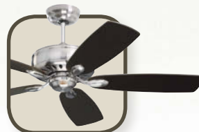
Avant Eco CF921 - pg. 23