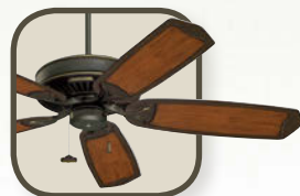
Premium Select CF4801 - pg. 24