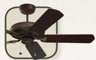
Crown Select CF4501 - pg. 22