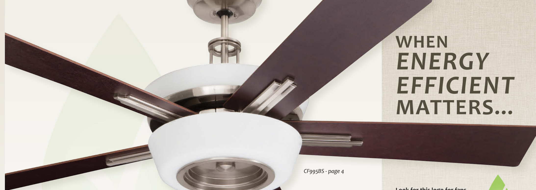
CF995BS - page 4