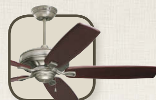
Carrera Grande CF787 - pg. 6