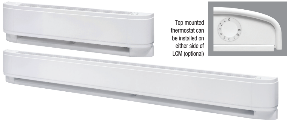
Top mounted thermostat can be installed on either side of LCM (optional)