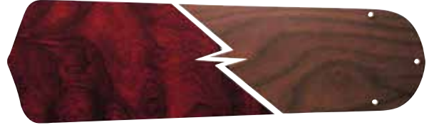
Blade Finish BELN52-RWWN 52" Contractor Reversible Rosewood/Walnut