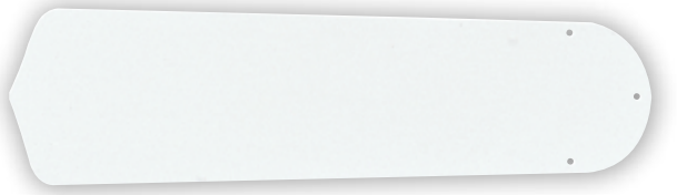
Blade Finish BCD42-W • BCD52-W 42", 52" Contractor White