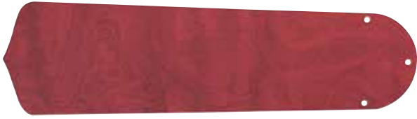
Blade Finish BCD52-RW3 52" Contractor Rosewood