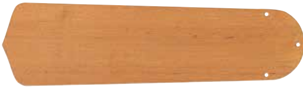
Blade Finish BCD52-TK7 52" Contractor Teak