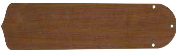
Blade Finish BCD52-WWB 52" Contractor Washed Walnut Birch