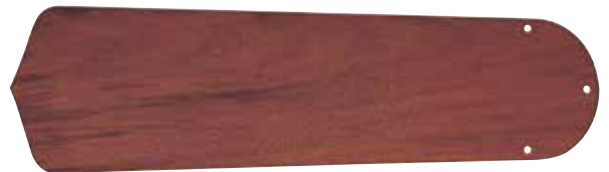
Blade Finish BCD42-WB6 • BCD52-WB6 42", 52" Contractor Walnut