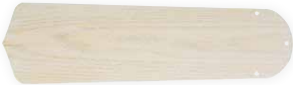
Blade Finish BCD52-WA 52" Contractor White Washed