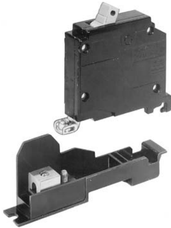
CHB Breaker Mounting Base

QCR and QCF Breakers provide a 50% space savings over 1-inch per pole designs of the same rating.