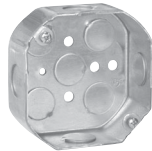
TP274, TP278, TP834*

1 1/2" DEEP FOR CONDUIT – NO CLAMPS FIXTURE RATED UL LISTED