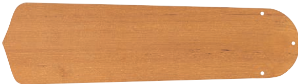
Blade Finish BCD52-TK7 52" Contractor Teak