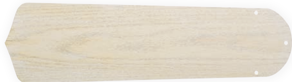
Blade Finish BCD52-WA 52" Contractor White Washed