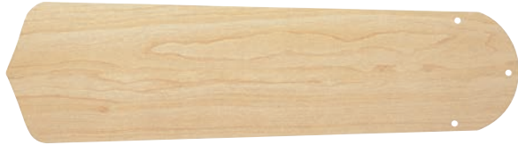
Blade Finish BCD42-MP • BCD52-MP 42", 52" Contractor Maple