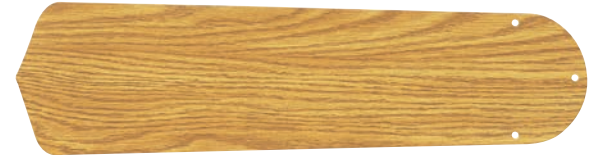
Blade Finish BCD42-LOK • BCD52-LOK 42", 52" Contractor Light Oak