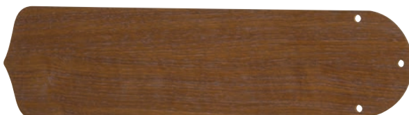
Blade Finish BCD52-WWB 52" Contractor Washed Walnut Birch