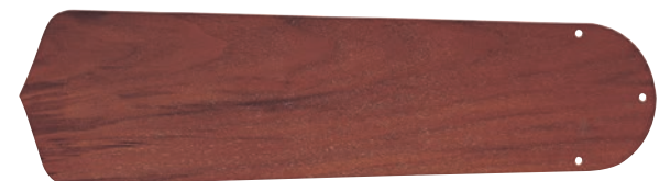
Blade Finish BCD42-WB6 • BCD52-WB6 42", 52" Contractor Walnut