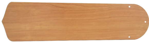
Blade Finish BCD42-PW • BCD52-PW 42", 52" Contractor Pear Wood