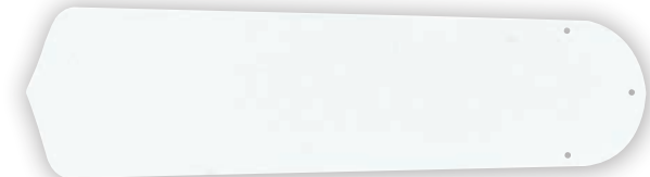
Blade Finish BCD42-W • BCD52-W 42", 52" Contractor White