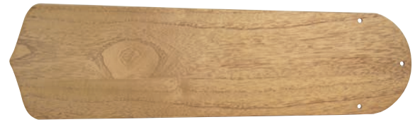
Blade Finish BCD52-PEC 52" Contractor Pecan