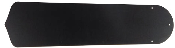
Blade Finish BCD42-OB • BCD52-OB 42", 52" Contractor Oiled Bronze