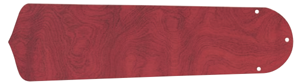
Blade Finish BCD52-RW3 52" Contractor Rosewood