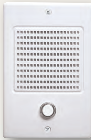
NDB300WH – Door Speaker