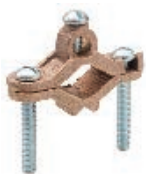
1307-B, 1309-B, 1309-DC, 1315-B