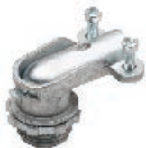
3/8" thru 2"