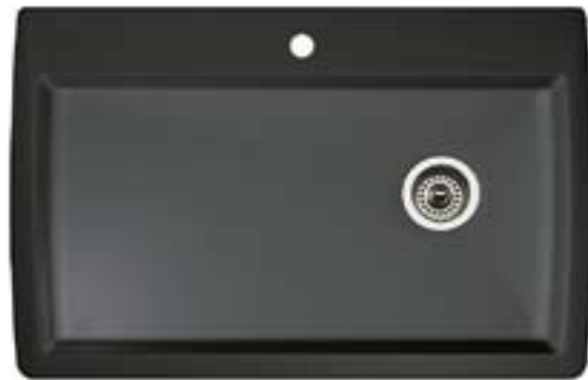
Model 440194 shown