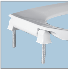
PLASTIC HINGES WITH STAINLESS STEEL POSTS AND PINTLES