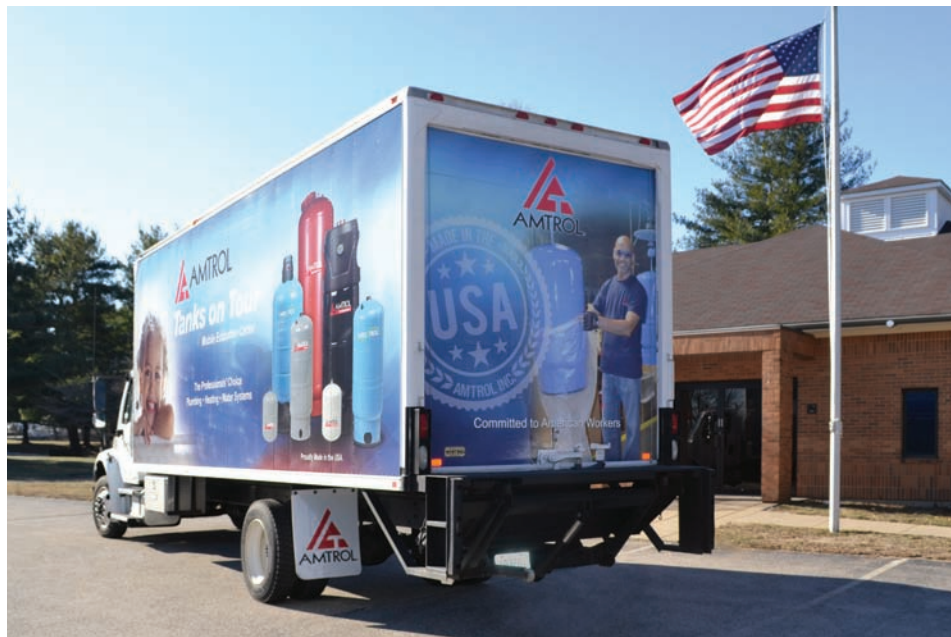
Tanks on Tour™ in front of the Amtrol Education Center.

All models are Amtrol Rewards™ eligible. Visit amtrolrewards.com