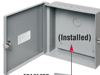
EB1212BP Shown with back plate installed