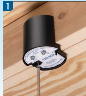
1. Position box alongside joist. Tighten center screw, mounting box to joist.