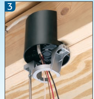
3. Remove captive bracket installation screws. Use them to mount fan/fixture bracket. (Installation of drywall not shown.)

Note: Install fan or fixture (not included) in accordance with manufacturer's instructions and all local applicable electrical codes, using the parked screws provided.