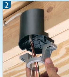
2. Position mounting bracket over locator posts to assure proper position. Pull wires through KO.