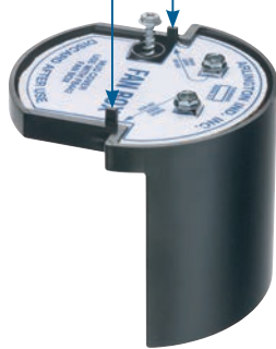
Locator posts for positioning of bracket installation screws

Our lowest cost L-shaped fan/fixture boxes mount securely to single or double joists with a shipped-in-place center screw.