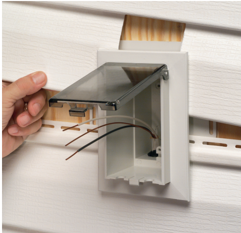
for New & Existing Vinyl Siding