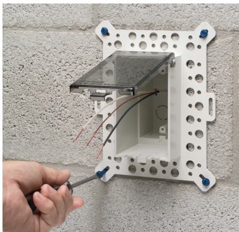
for Textured Surfaces, Rigid Siding