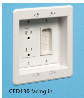
CED130 facing in