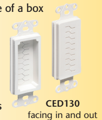
CED130 facing in and out

See our full line of SCOOP Entrance Plates, Hoods and Entry Devices on reverse.