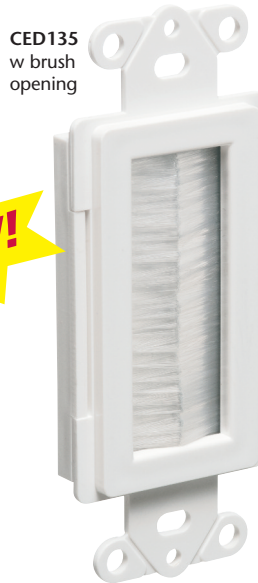
CED135 w brush opening