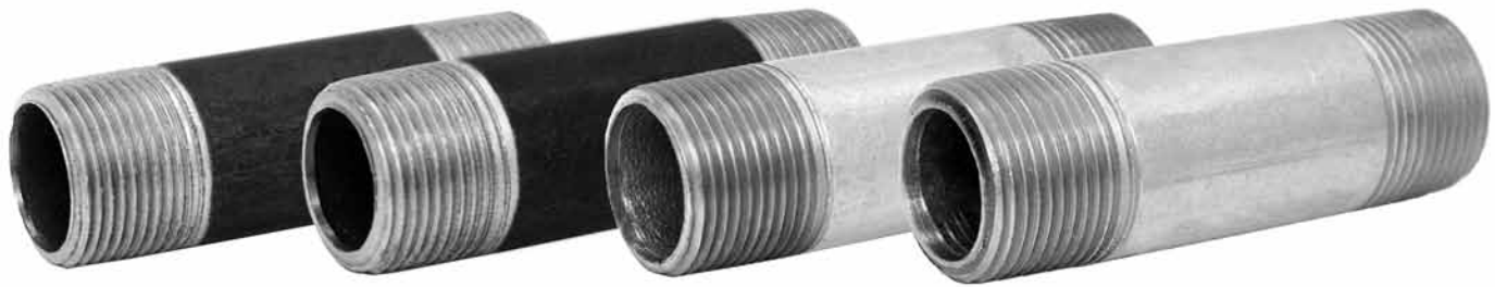
FIG. 339: Standard Black Schedule 40