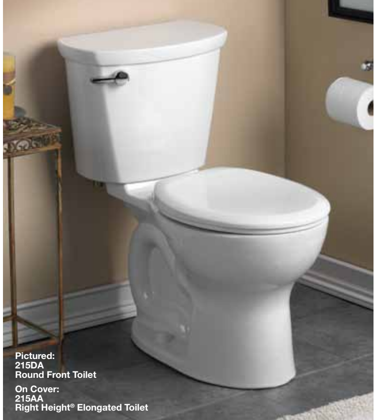
Pictured: 215DA Round Front Toilet On Cover: 215AA Right Height® Elongated Toilet