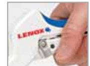
Easy Open & Close