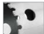
Easier Plug Removal