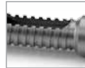
Easier Plug Removal