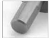
No Arbor Needed